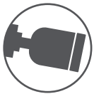
5MP Security Camera