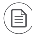
Quick Start Guides