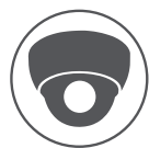
5MP Super HD IP Security Camera